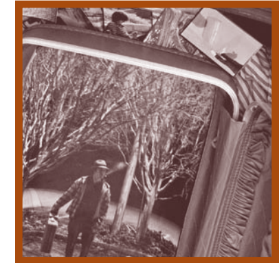
Out the Window: A Portrait of Garrett Photographs, wood, suitcases, surfboard, and lamp 7 x 7 x 3 feet

Through installing a complete environment, my intention is to break the illusion that is created by any particular image. The whole structure shares the dimensions of the traditional 35mm rectangle and medium format square. Each side is layered with texture, forcing the viewer away from the subject matter, back to the basic materiality of black and white paper. Juxtaposition of the paper and environmental artifacts shows the process of reconstructing a persona.