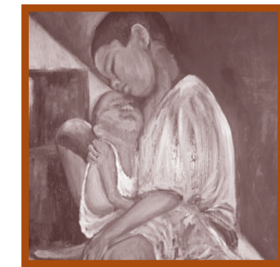
Immigration: A Vision of Hope Oil paint, encaustic, wood, concrete, fiberglass, American flag, sheet metal, found objects 8 x 20 x 1 feet

Immigration: A Vision of Hope sheds new light on this controversial and heated topic and creates an opportunity for the viewer to step into the shoes of immigrants and see the world through our eyes.