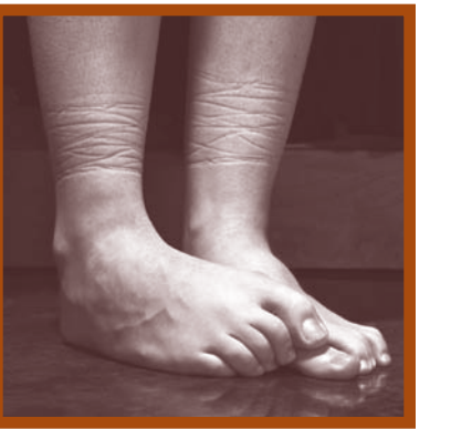
Beneath the Waking Life Seven monochrome C-prints 15.125 x 15.125 inches

Our minds are never static, never fixed at one point in their experiential transactions with the world: we constantly slip above and beneath the grasp of our conscious perceptions. My work represents the experiences that do not—and cannot—manifest themselves to our physical senses, but rather ones that subconsciously or emotionally perform in parallel to the interactions in our waking lives. In our human condition, I believe we all have thoughts, ideas, fears, questions, epiphanies, and other invisible facets of our lives that we certainly do not fully understand but experience nonetheless. Existence. Identity. Consciousness. Belief. Mortality. My photographs do not attempt to explain or provide answers to these implicit questions; they instead reach out, touch, and quietly spend time with them to make resonant gestures toward simply understanding.