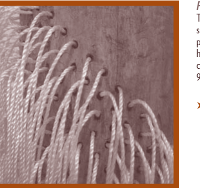
FUZZMUCK and a Things' Thing-ness Table, chair, acrylic paint, cotton cord, sewing thread, acrylic string, rabbit fur, plywood, prayer bench, synthetic hair, human hair, latex paint, driftwood, and cow skull 9 x 10 x 8 feet

The optic nerve holds such power over our bodies that it causes us to cringe, love and salivate. In toying with synthetic natural and natural synthetic materials, I explore how we judge, map, and create our reality. By creating surface tension, I look deeper past the surface to the support. It seems rigid but is actually fluid—both support and surface are changing.