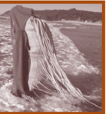
Attempt One Performance April 1, 2011, 5:00-7:00p.m. Hoffman Gallery