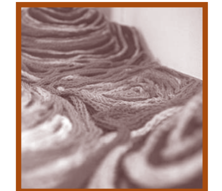
Breathing: the silent resonance of spirits Mixed media 8 x 12 x 8 feet

The balance between the outer nature and the inner self is life, controlled by the energy of the universe qi , which itself is a living spirit that is... Breathing.