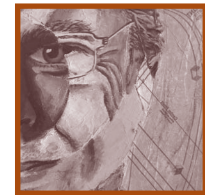
Secrets and Lies Graphite, oil paints, spray paints, markers, and collage on canvas, wood, paper, and vellum Overall installation dimension 108 x 120 inches; individual portraits, variable dimensions

The average American sees an estimated 3,000 advertisements every day. In this series, I have borrowed images from advertisement, as well as the mass media and popular internet search engines, to create likenesses of people who are either unidentified or completely imaginary. By emulating these likenesses of strangers we see daily but know nothing about, aside from whatever product they are selling, I create characters that we do not recognize, and yet they are strangely familiar. These characters are presented all at once, with the intent of slightly overwhelming the viewer, mimicking the constant stream of information from whence these characters emerge. Through the opulent framing, and the meticulous process of oil painting, these figures are elevated to a place traditionally reserved for distinguished individuals. In a world, where fame is more a goal than the by-product of one's achievements, who deserves being portrayed?