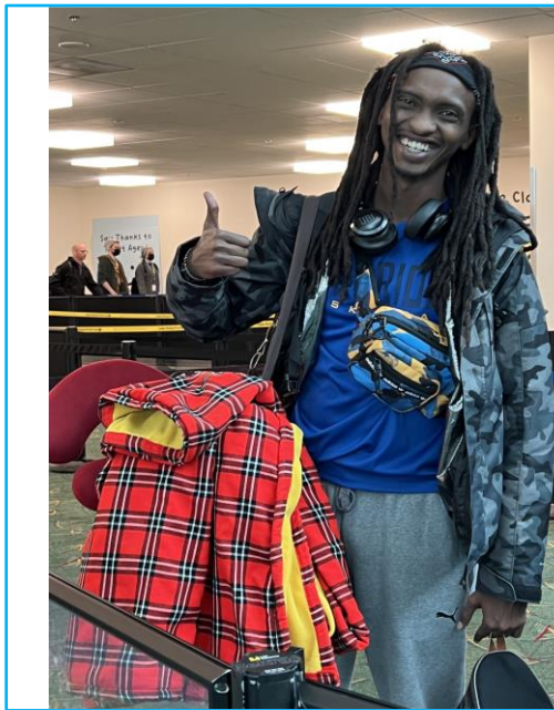
Photo at Portland International Airport, May 2023