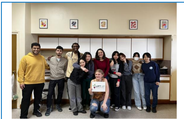
AES Class Volunteers at Lift UP Food Pantry April 2023

Lastly, I would like to thank my classmates and other students for working together very enthusiastically. I hope we all use the skills that we learned here at AES in our future studies and careers.